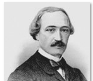
Karl Josef Bayer (1847-1904) at the Russian plant